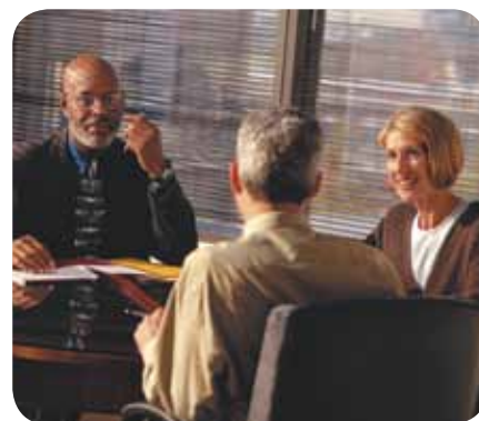
The Planned Giving Program has allowed agencies' donors an opportunity to support their favorite causes into the future.

The TCF Planned Giving Partnership Program broadens an agency's charitable giving by assisting it with developing, implementing and sustaining a fully-integrated planned giving program within its development activities.