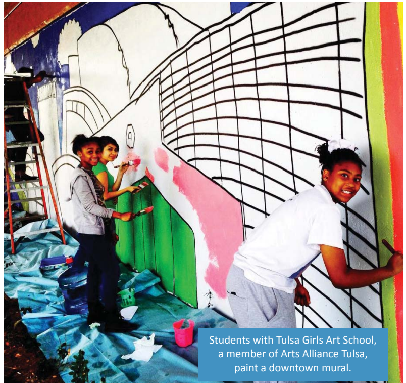
Students with Tulsa Girls Art School, a member of Arts Alliance Tulsa, paint a downtown mural.