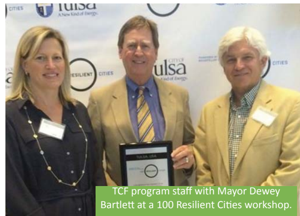
TCF program staff with Mayor Dewey Bartlett at a 100 Resilient Cities workshop.