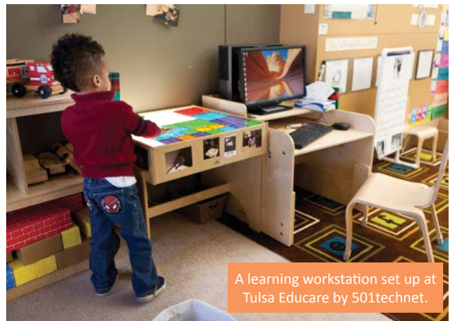
A learning workstation set up at Tulsa Educare by 501technet.