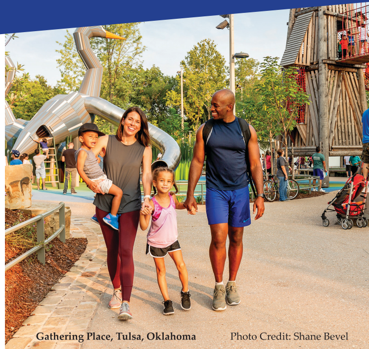
Gathering Place, Tulsa, Oklahoma